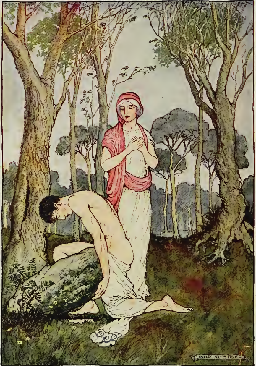
The great rock stirred!